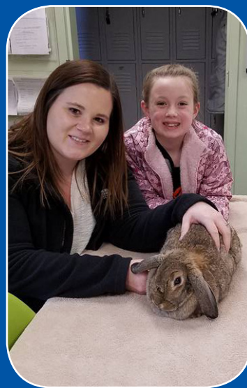
Emma Adopted 01/26/19