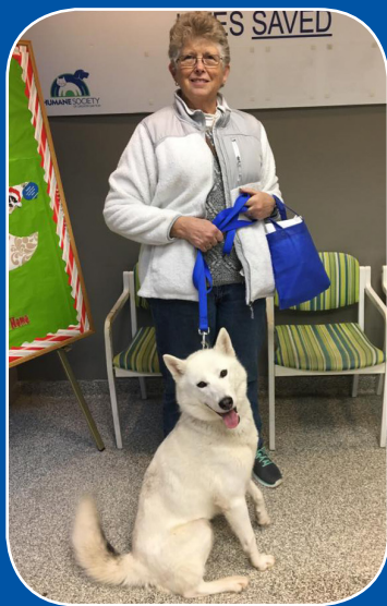
Pandora Adopted 01/11/19