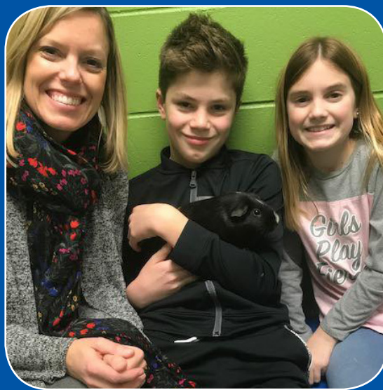
Meatball Adopted 01/23/19