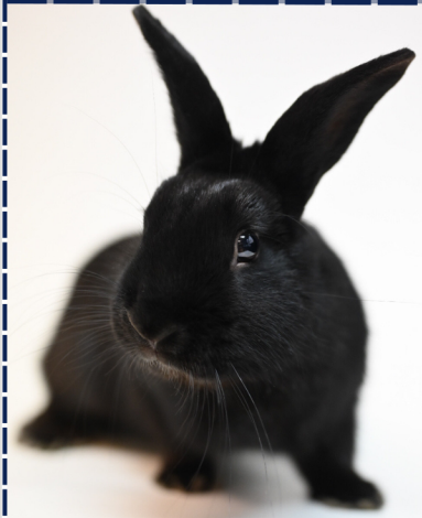
Peppercorn Adopted 7/29/2022