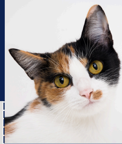
Hula Adopted 10/09/2023

Scan the QR Code with Your Phone to Watch Cyrus' Story