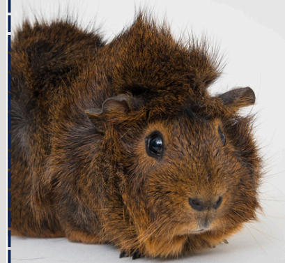
Spud Adopted 07/19/2023