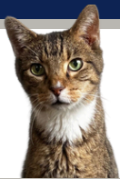
Marquis Adopted 11/02/2023