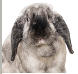
Viv Adopted 02/17/2023