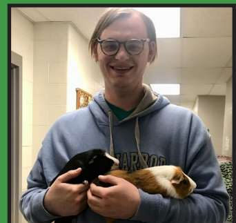
Jimmie & Gopher, adopted 01/20/24