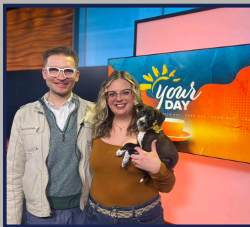
Toadette, adopted 01/26/24